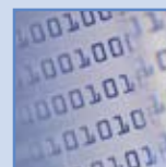
Planning for the Worst