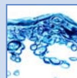
Better Safe than Sunk