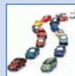
A Fleeting Risk